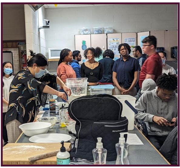
Making the dough